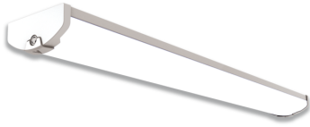
LED Surface Linear