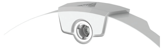
LED Surface Linear End Cap